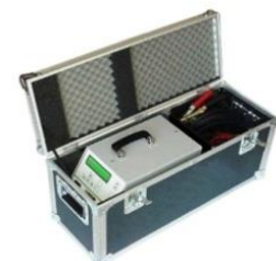
Voltage sense cables