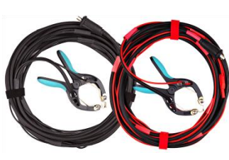
Current and Sense cables with TTA clamps

All specifications herein are valid at ambient temperature of + 25 °C and recommended accessories. Specifications are subject to change without notice. Specifications are valid if the instrument is used with the recommended set of accessories