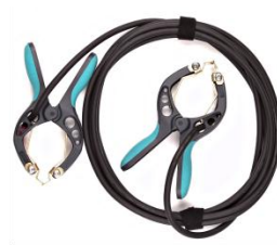
Current connection cable with TTA clamps