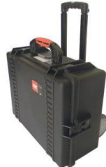
Cable plastic case with wheels