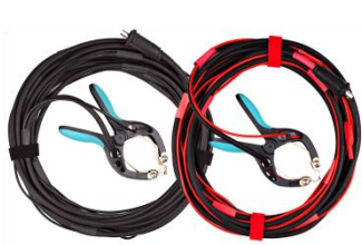
Current and Sense cables with TTA clamps

All specifications herein are valid at ambient temperature of + 25 °C and recommended accessories. Specifications are subject to change without notice.