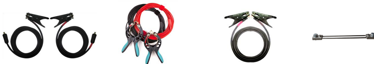
Current cables with battery clamps