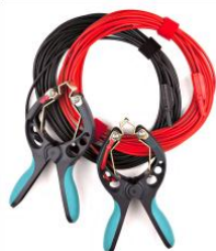
Voltage Sense cables with TTA clamps