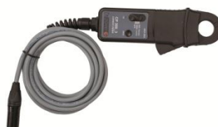
Current clamp 30/300 A with extension 5 m (16.4 ft)