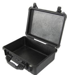
Cable plastic case