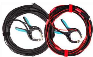
Current and Sense cables with TTA clamps