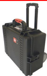
Cable plastic case with wheels