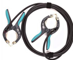
Current connection cable with TTA clamps